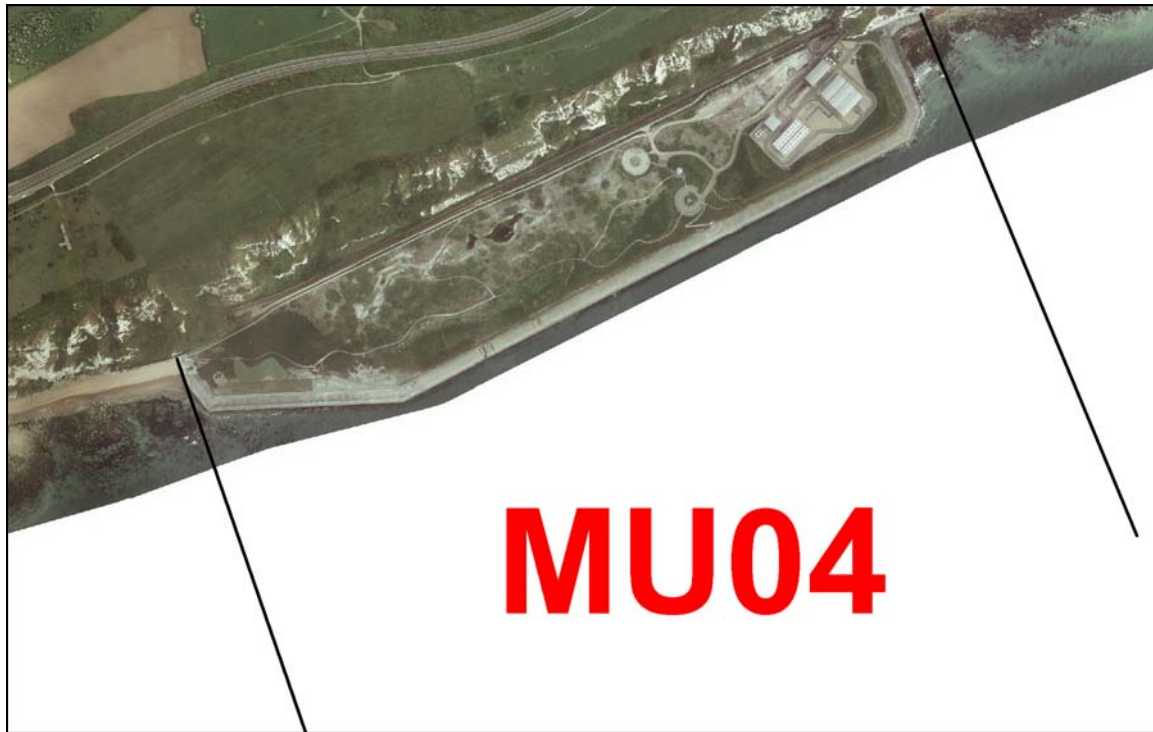
Figure 1: Management Unit 04 (Samphire Hoe)